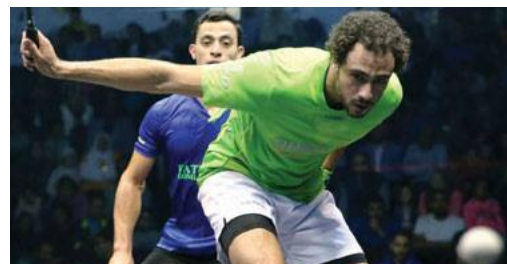
Ramy Ashour fires a winner in his stormy quarter-final against Fares Dessouky

"That was very stressful, definitely," Ashour commented, adding: "I don't want to get into too many details, but I just felt that God was giving me something when we were playing."