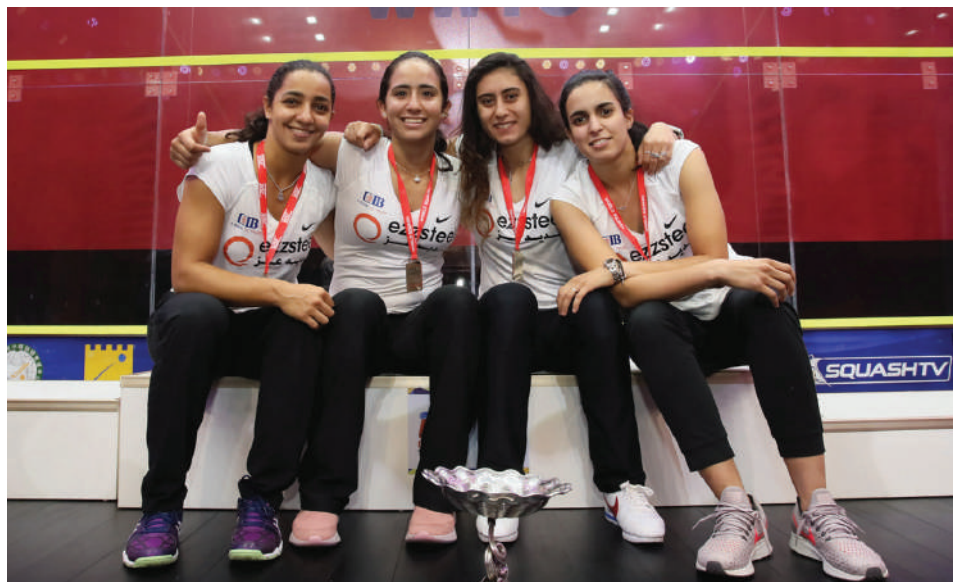
Egypt's World Women's Team Championship-winning squad