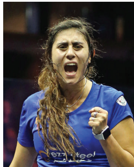
Nour El Sherbini