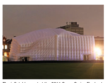
The inflatable court at the 2011 Super Series Finals at London's Queen's Club prepares for take-off in high winds