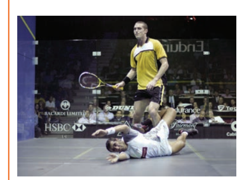
The glass floor, used in humid conditions at the 2007 World Open in Bermuda, resembled an ice rink