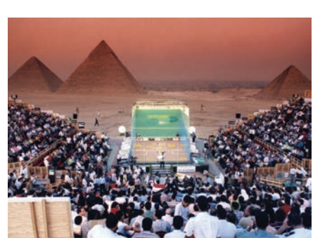
Wind and sand caused problems at the 1999 World Open in Egypt, with players slipping and sliding