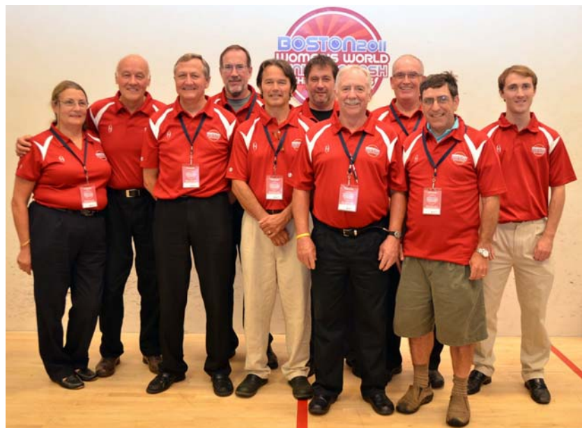
Boston Referees on Parade

David Palmer lost to Gregory Gaultier 9-11, 4-11, 0-11 (47m)