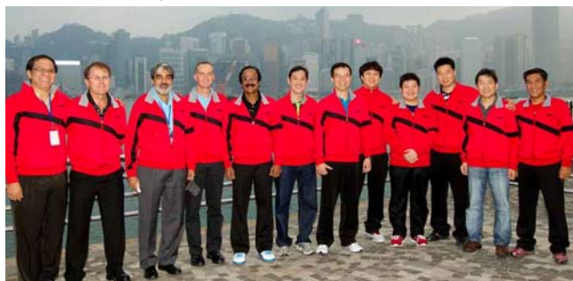
The referee contingent at the recent Hong Kong Open

There is a great deal to look forward to in 2012, but first must come a really big thank you to so many organisations and individuals for your interaction and support. I know that I speak for the officers and us staff alike saying that the goodwill and enthusiasm in our sport surely cannot be replicated elsewhere.