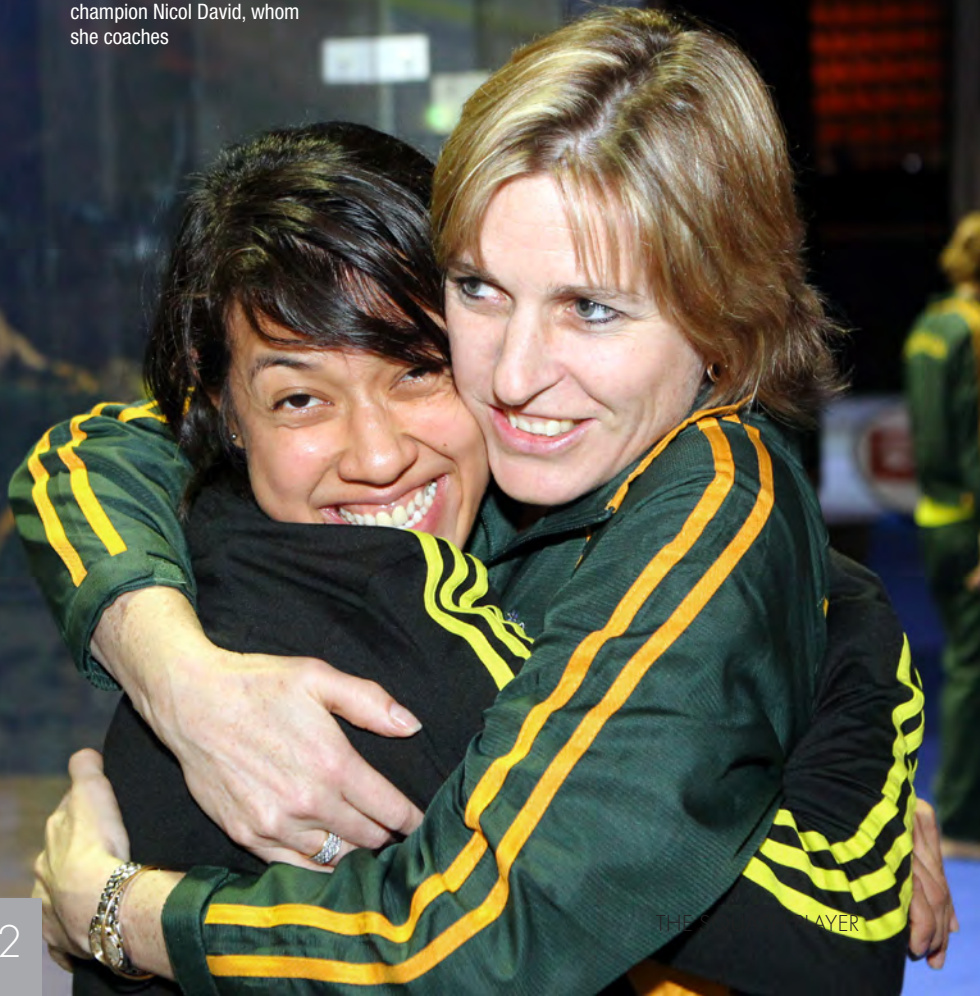
Past world champion Sarah Fitz-Gerald (right) hugs current world champion Nicol David, whom she coaches

Fitz-Gerald still plays pennant league squash, too, at Kooyong, and sometimes she does MC-ing or TV commentating. Her